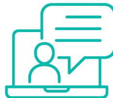
Semi-structured interviews Three current partners

In early 2023, ASHM conducted stakeholder consultation via a listening exercise through semi-structured interviews and open-ended survey questions with 10 current and former partner organisations across nine countries in Asia and the Pacific. A list of organisations who participated can be found in Appendix A, alongside a summary of ASHM's projects with each partner.